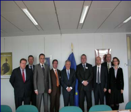
Mission to Brussels, AEB Board members' meeting with EU Commissioner for Taxation & Customs László Kovács