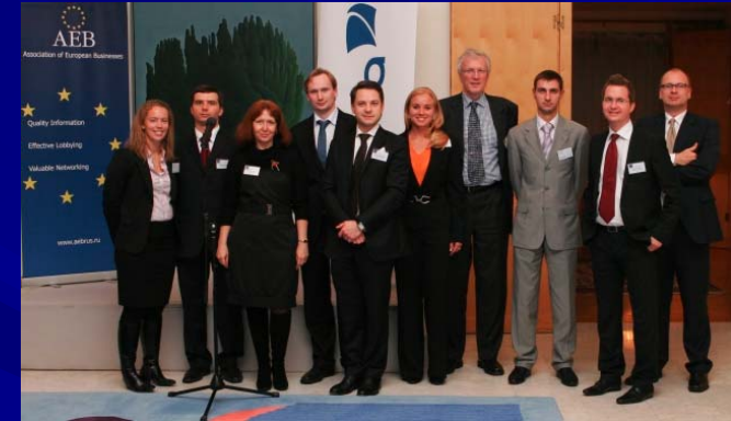
AEB Swedish Euroreception, October 8 th 2009