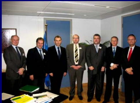
Mission to Brussels, AEB Board members' meeting with EU Commissioner for Energy Andris Piebalgs

The AEB is a non-commercial association of European enterprises and entrepreneurs that have business activities with and in Russia