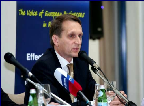
Sergey Naryshkin , Deputy Prime Minister of the RF

The AEB keeps its members up to date on industrial, economic and legislative developments