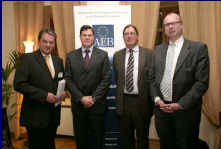
Open meeting with Alexey Mordashov , General Director, Severstal

The AEB provides essential links between the EU authorities, Russian political and administrative institutions, and European business interests