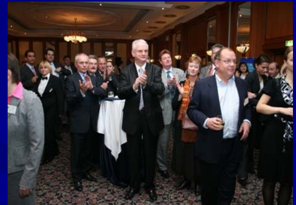
AEB Annual General Meeting 2007