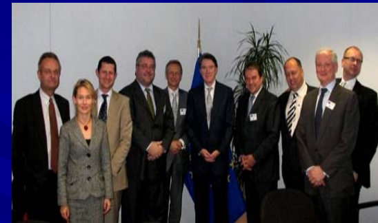
Mission to Brussels, AEB Board Members' meeting with EU Commissioner for Trade Peter Mandelson