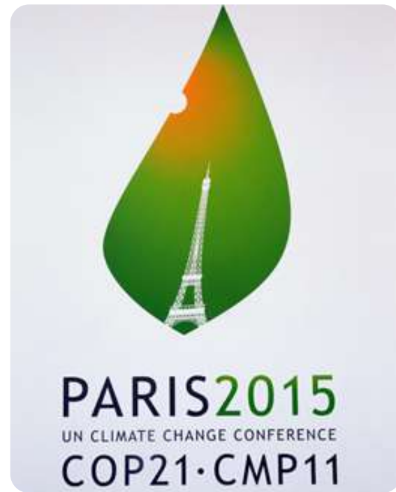
Ratified by the Russian Federation in September 2019