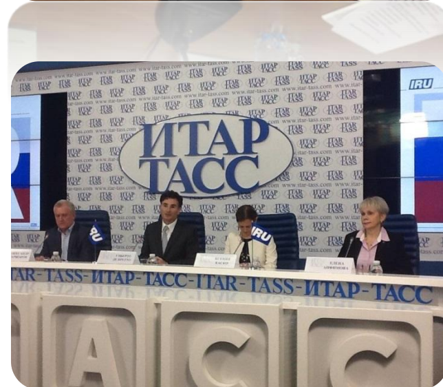
AEB Customs and Transport Committee representatives participated in the IRU press conference, 26 March 2014.

Representatives of the scientific and business communities briefed the audience on the economic consequences for Russia of suspension of the TIR system within Russia.