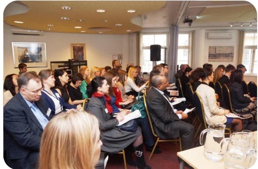
Audience at the briefing

The event was kindly hosted by the Consulate General of the Netherlands in St. Petersburg.