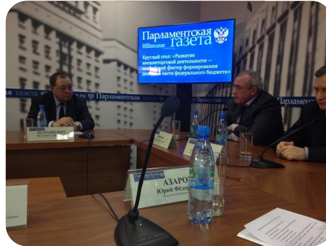
Participants of the round table with Mikhail Bryachak , First Deputy of State Duma Transport Committee, in the middle

The AEB described the most important issues in the customs area which AEB member companies faced in foreign trade activities with Russia: the residency principle in the Customs Union, the application of WTO rules, the mechanism of risk management system, the lack of electronic documentation turnover, the Authorized Economic Operator (AEO) system and categorizing of foreign trade participants, and the implementation of the Roadmap for customs administration.