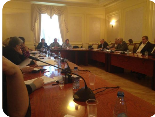
At the public hearing of the draft law

On 14 March 2014, AEB Migration Committee members took part in public hearing of the draft law "On amendments to the Federal Law 'On Legal Status of Foreign Citizens in the Russian Federation'" concerning changes in the "patent system" which mean that legal entities will be able to hire foreign employees based on a patent.