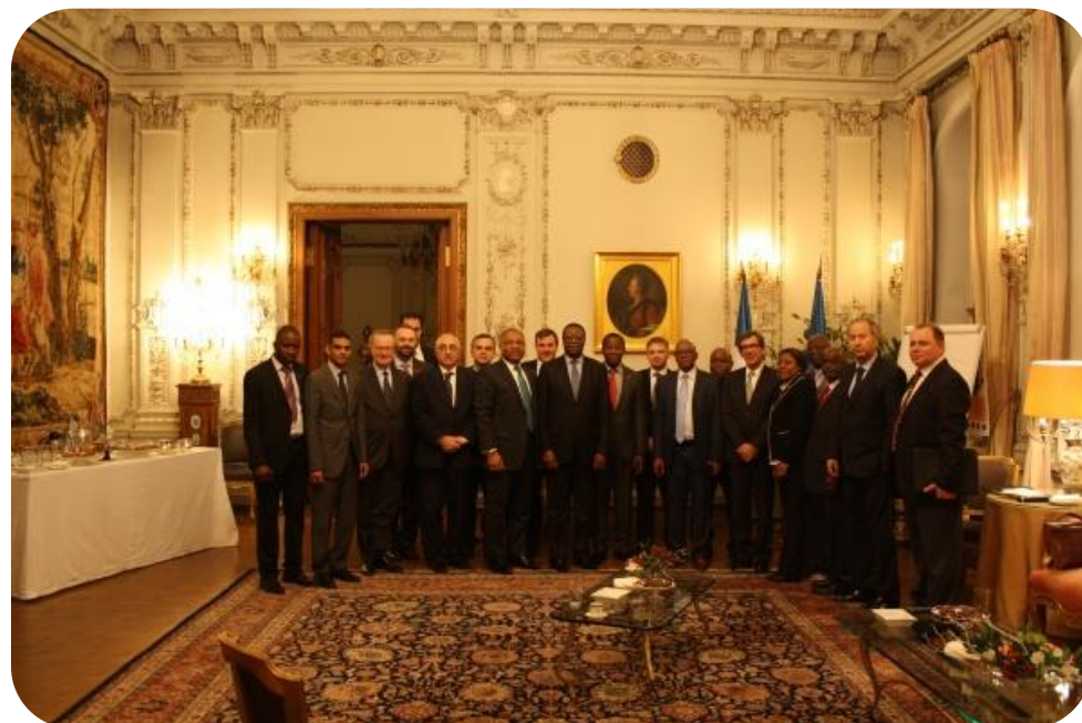
Guests of the event