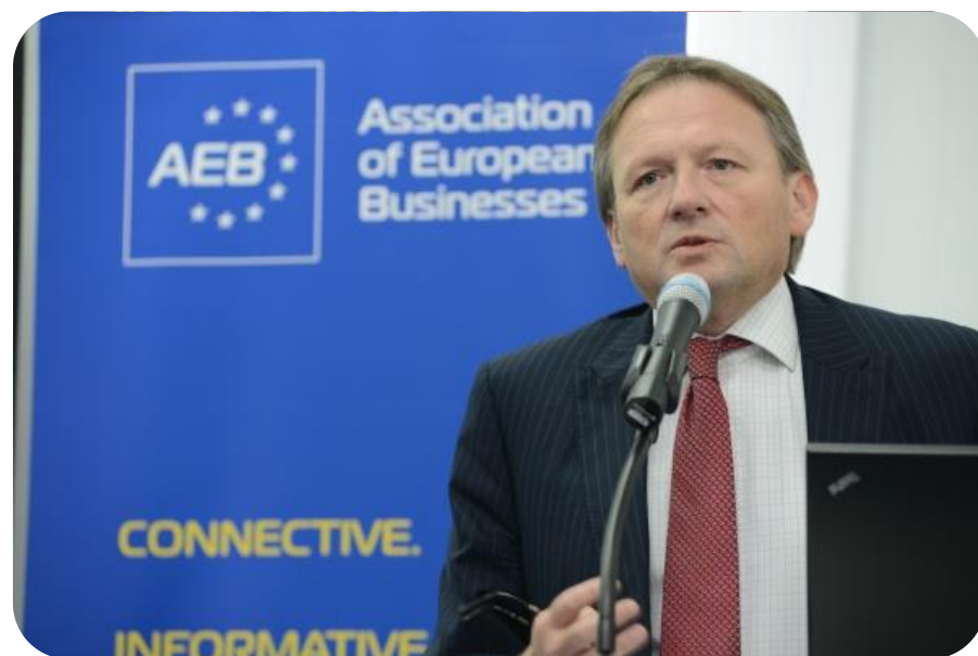
Boris Titov , Presidential Commissioner for Entrepreneurs' Rights Protection

Dmitry Marinichev , Ombudsman for issues related to elimination of violations of entrepreneurs' rights in implementation of regulation and control for Internet operations and development, told about recent developments regarding processing and storage of personal data of Russian citizens in databases on the territory of the Russian Federation.