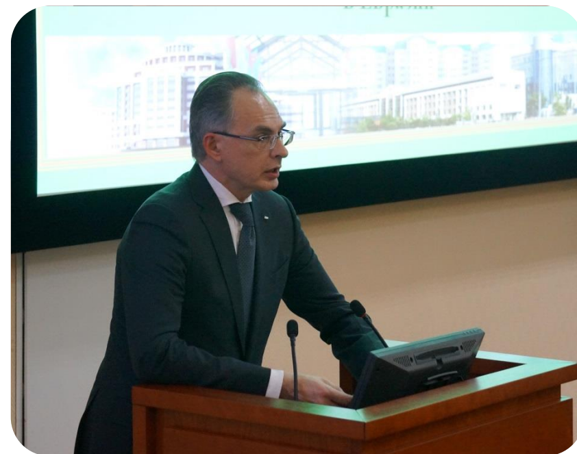
Dmitry Cheltsov , Chairman of the AEB Customs and Transport Committee, IRU Permanent Delegation to Eurasia

Mr. Cheltsov touched in his speech the most important issues for European businesses in the customs sphere in CU: an imperfect system of administrative responsibility for customs rules violation, the TIR Convention in Russia, development of the institute of authorized economic operator and single window in Customs Union.