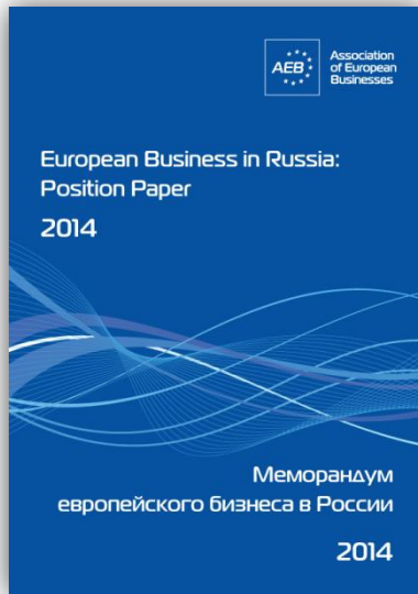
Position Paper 2014

Following publications were published in November 2014: