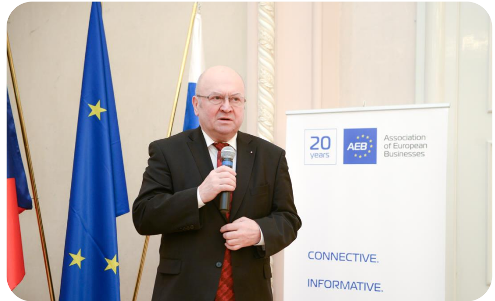
Vladimir Remek , the Ambassador of the Czech Republic