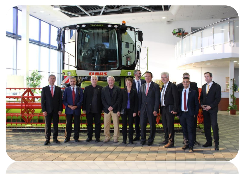
Members of the delegation from Karlsruhe visiting Claas production plant in Krasnodar

In the frames of the event, the sanctions consequences for the Russian and European economy were discussed. Doing business in Krasnodar and the creation of interaction mechanisms between business and municipal authorities was another significant topic.