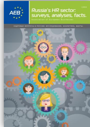
Russia's HR Sector: Surveys, Analyses, Facts