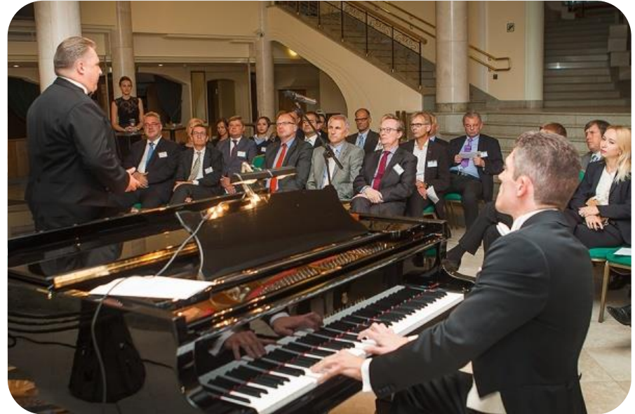
Guests of the event