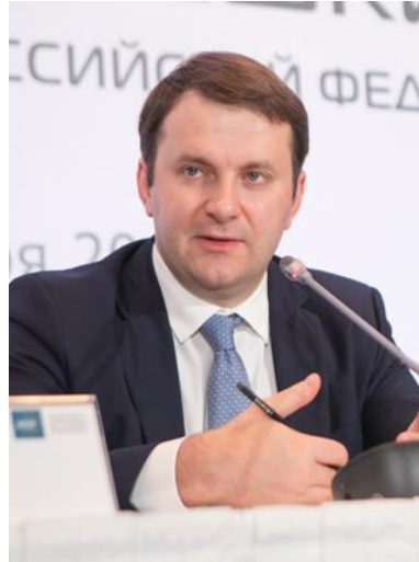
Maxim Oreshkin, Minister of Economic Development of the Russian Federation