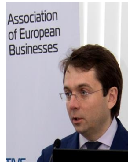
Andrey Chibis Deputy Minister of Construction, Housing and Utilities of the Russian Federation