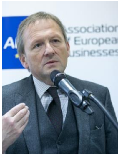
Boris Titov, Presidential Commissioner for Entrepreneurs' Rights Protection