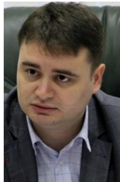
Vasily Osmakov, Deputy Minister of Industry and Trade of the Russian Federation