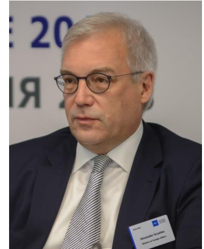
Alexander Grushko, RF Deputy Minister of Foreign Affairs