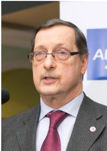
Alexey Arbatov, Full member of the Russian Academy of Sciences, Head, Center for International Security at the Institute of World Economy and International Relations (IMEMO)