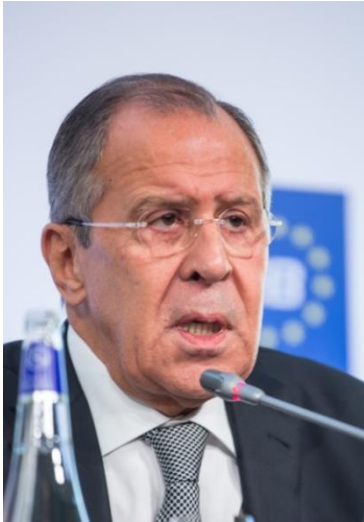
Sergey Lavrov, Minister of Foreign Affairs