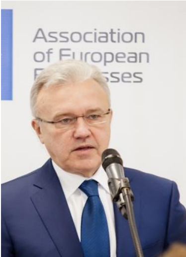
Alexander Uss, Acting Governor of the Krasnoyarsk region