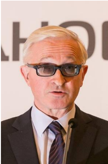
Alexander Shokhin, President of the Russian Union of Industrialists and Entrepreneurs (RSPP)