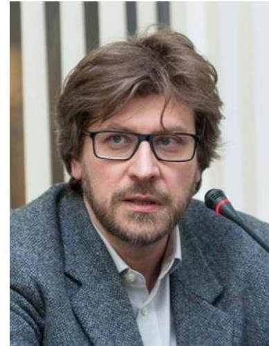
Fyodor Lukyanov, Editor-in-Chief, "Russia in Global Affairs", Chairman of the Presidium of the Council on Foreign and Defence Policy