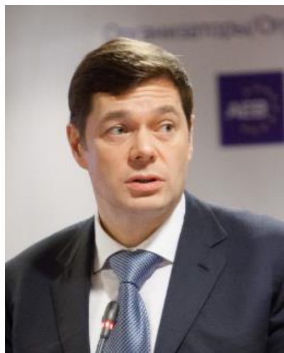
Alexey Mordashov, Chairman of the Board, Severstal