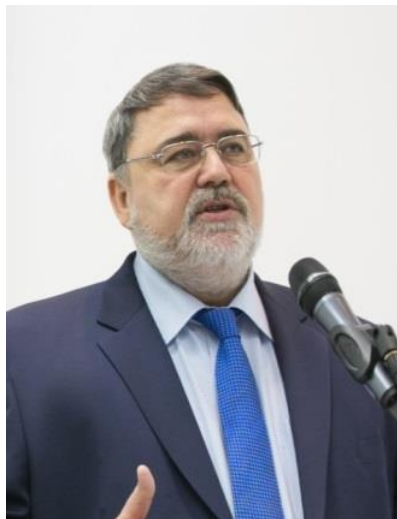
Igor Artemiev, Head of the Federal Antimonopoly Service