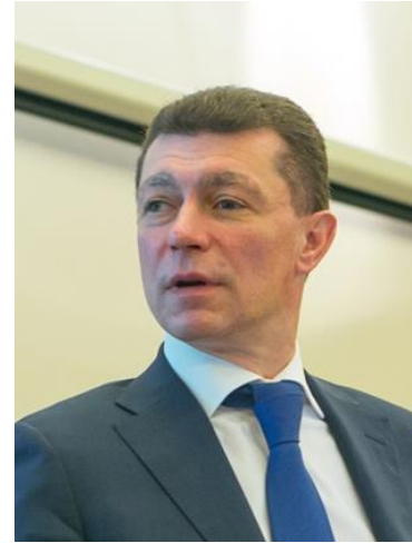
Maxim Topilin, Minister of Labour and Social Protection