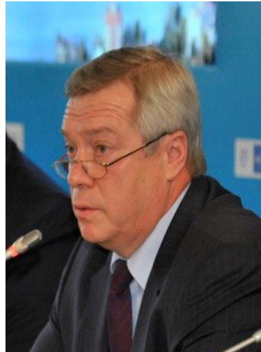
Vasily Golubev, Governor of the Rostov Region