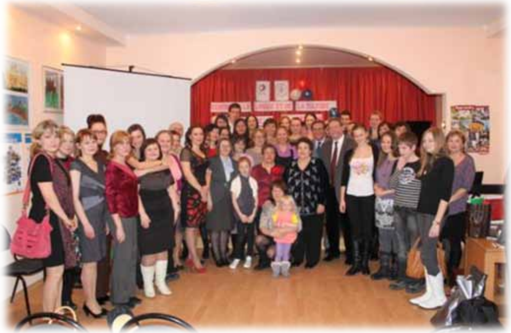
10 th anniversary of the Center - March 2012