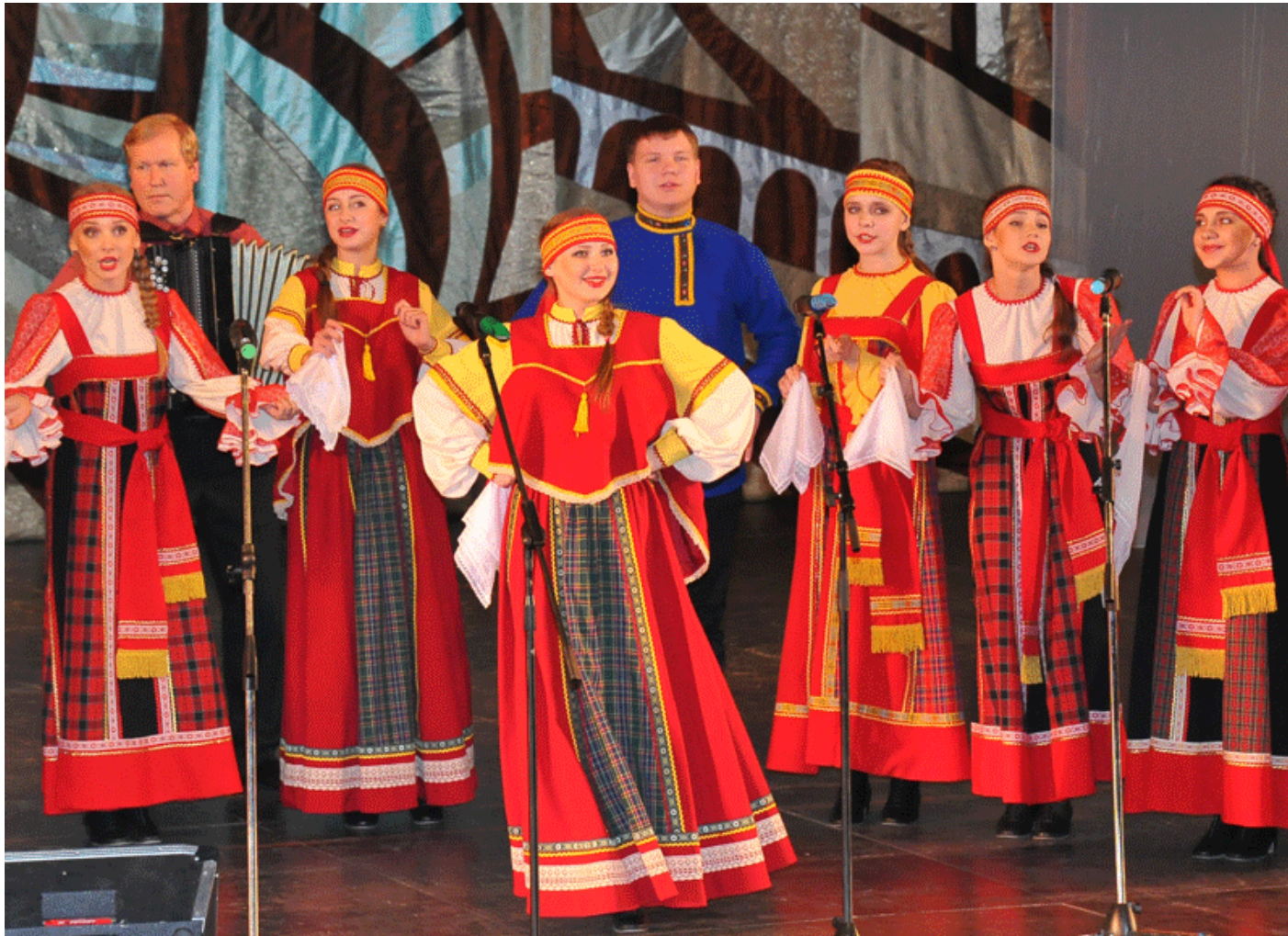
Singing contest in Veliky Novgorod (January 2013). Kharyaga PSA partners covered part of the travel costs.