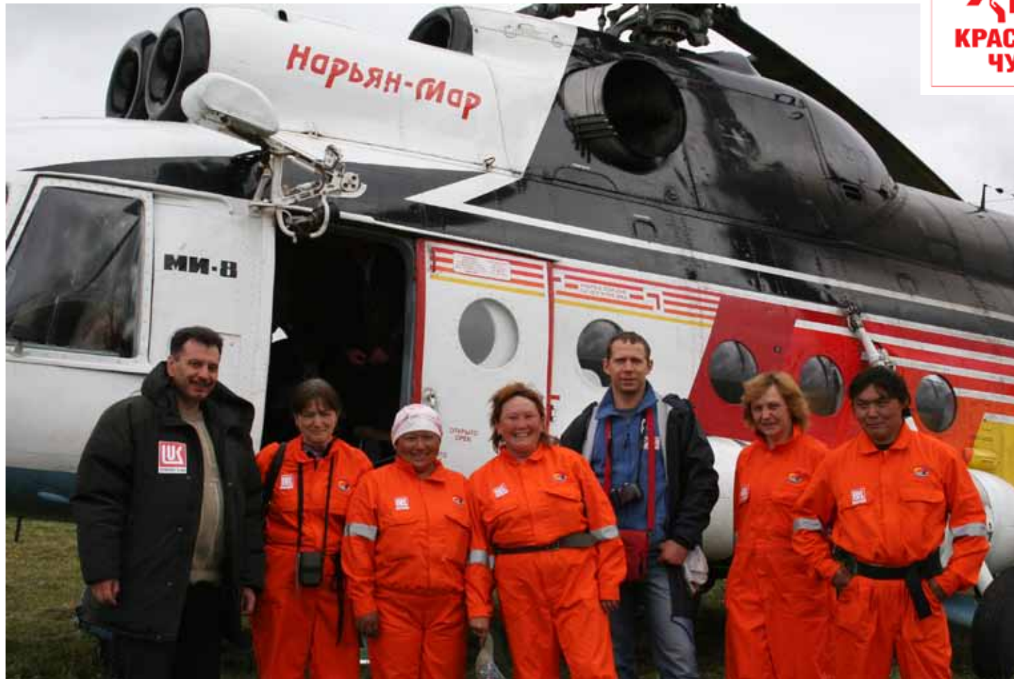
Medical team with the representatives of Lukoil and Total