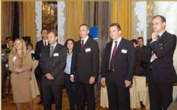
AEB Cocktail – “Opening of the Business Season”. September 10, 2008.