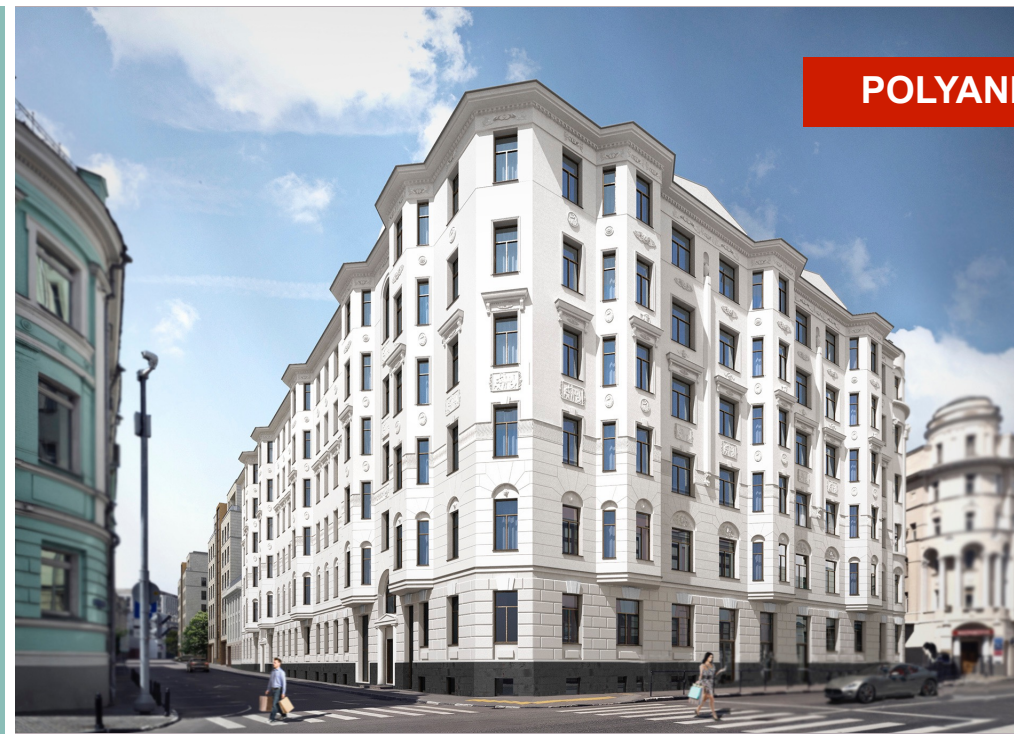
POLYANKA / 44