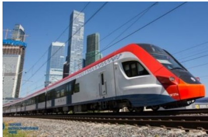
Transport and industrial vehicles