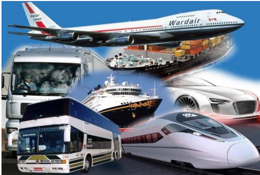
Transport and industrial vehicles