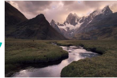
Natural landscapes, rivers, lakes, biodiversity