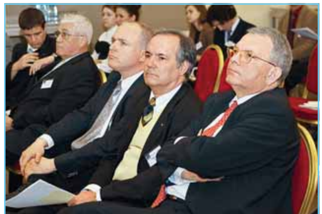
AEB Summer Cocktail. June 29 th , 2010