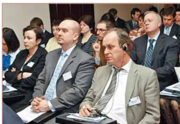
Presentation on the Investment potential of the Krasnodar city. May 12 th , 2010