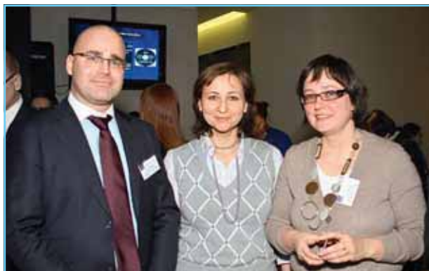
AEB Winter Cocktail – “Cocktail in Red”. February 18 th , 2010