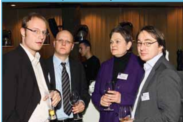
AEB Press Reception. January 28 th , 2010