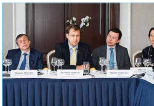
First European and Russian Business Forum – “Successful together”. September 23 rd to 25 th , 2010