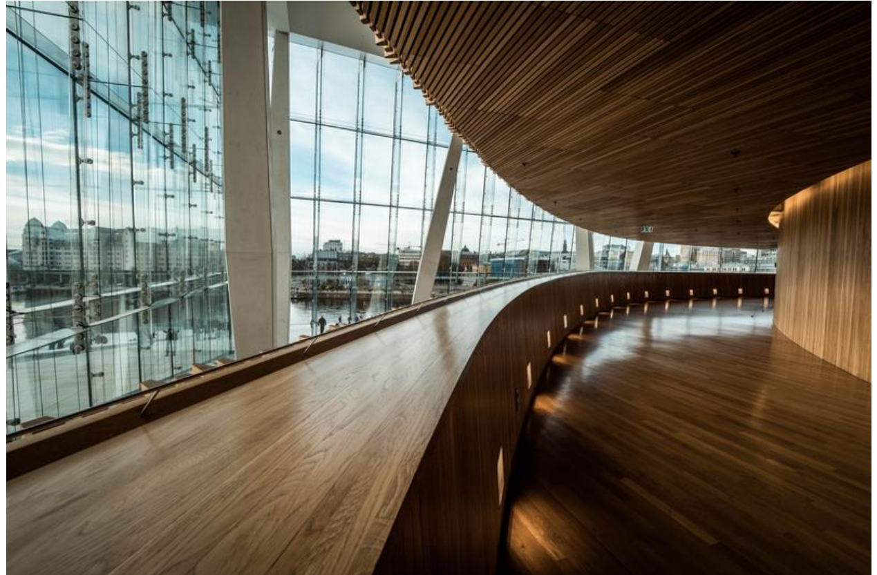
Opera house Oslo