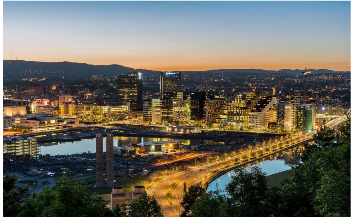
Oslo city centre