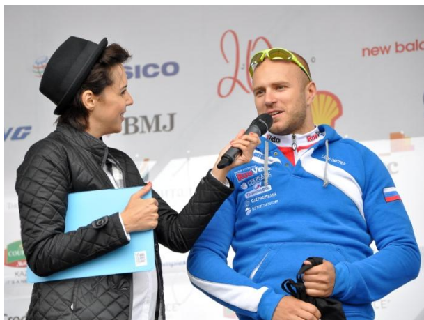
Olga Shelest Russian television and radio host, actress, VJ, journalist.